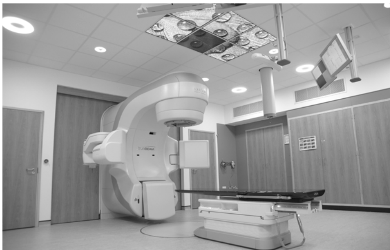
Picture 2 - Linear Accelerator

Your radiotherapy treatment will be given in daily doses, Monday to Friday, but not at the weekend.